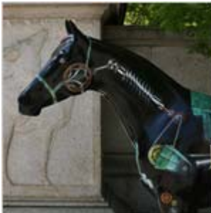
Man's Best Friend, Hoofed Department