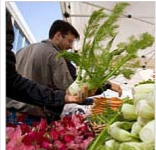
Tasting the Bounty of San Francisco Markets